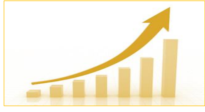
Referrals to MASH have increased by 39%